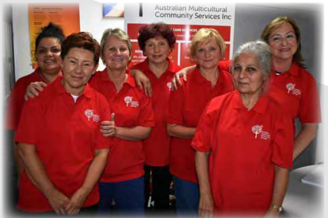
Representatives of our fantastic team!