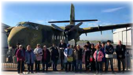
Volunteers visiting RAAF Museum

During the last financial year, the Social Support and Respite Programs team has been very active in providing support for seniors in their homes, during group sessions and in aged care facilities. We have expanded our Social Support Groups offer, increased the service hours in the Centre Based Day Respite Program and we have matched over 110 new clients from the Friendly Visiting Program, Community Visitor Scheme (CVS) Program, and CVS Expansion Program who were socially isolated with a friendly visitor. Furthermore, we had the opportunity to expand our visiting programs thanks to the one-off funding from Gandel Philanthropy and Aged Persons Welfare Foundation.