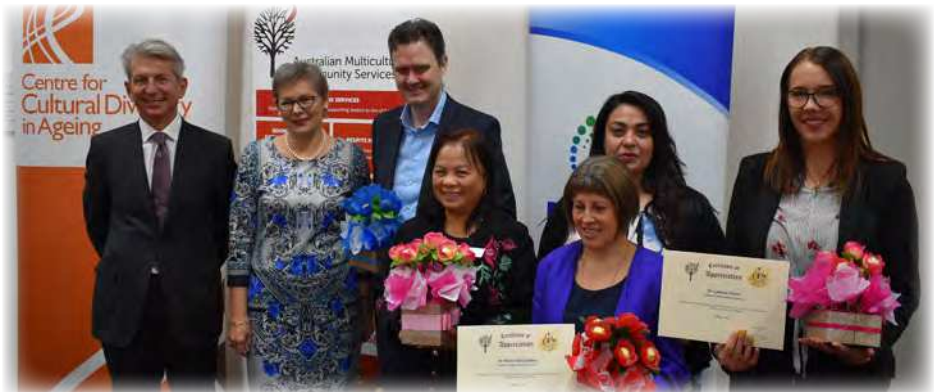
AMCS Information Resource Kit launch with the Minister for Multicultural Affairs