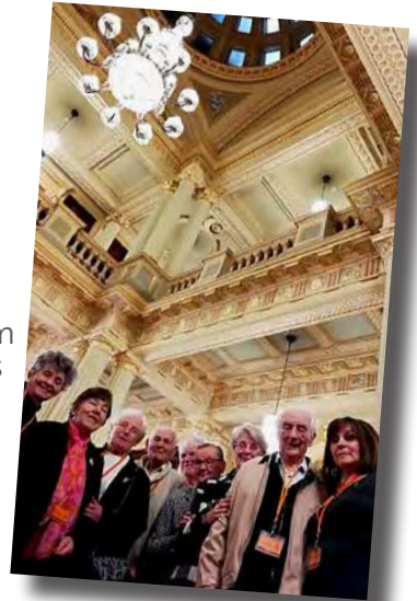
Seniors trip to Parliament House